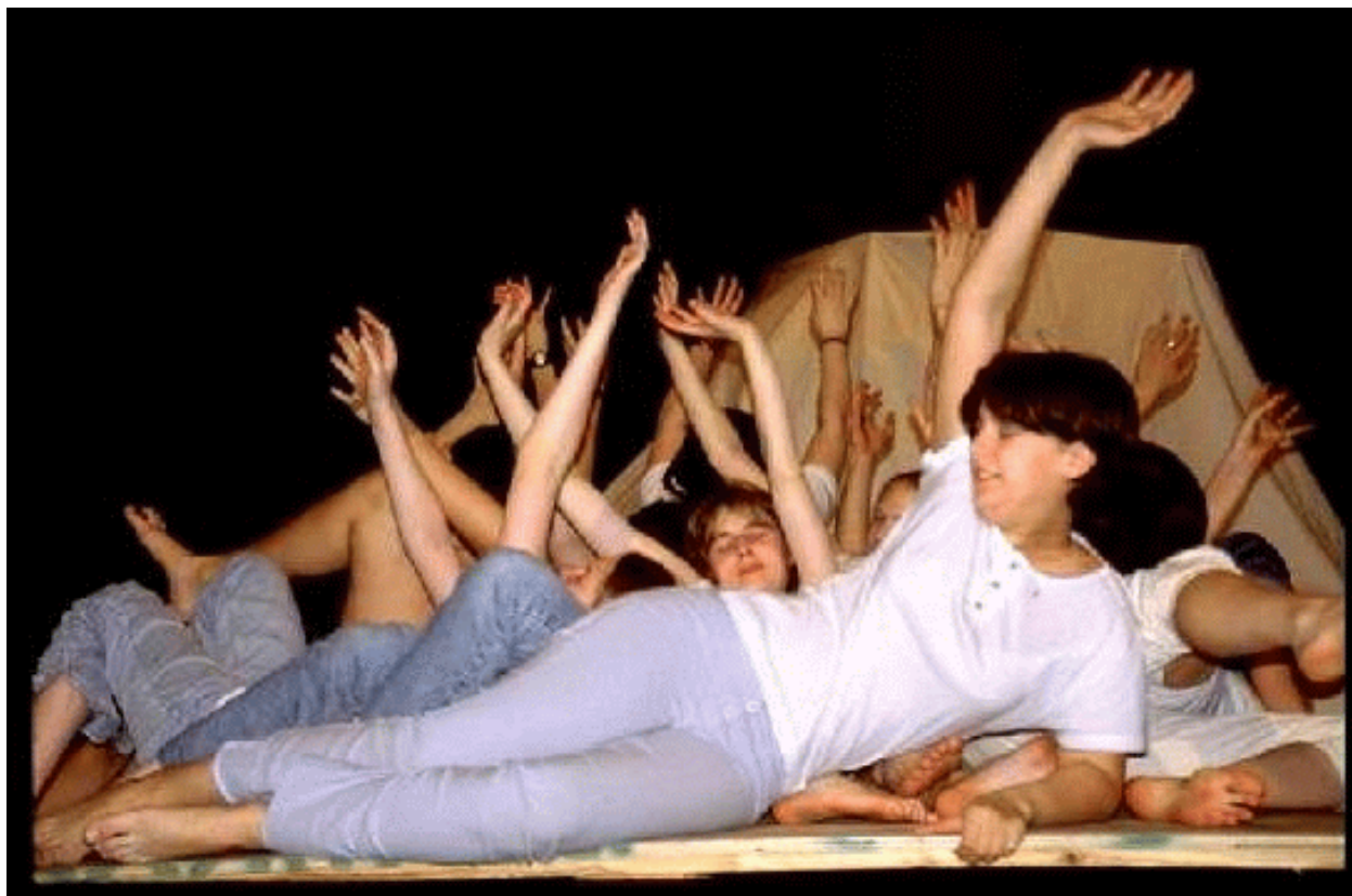
Training for the 2002 Olympics —With the boating season finished, OYC women now practice ashore, shown here executing a precision maneuver in their synchronized swimming routine.

If we don't see you at this party, we hope you have a happy and safe holiday season, and look forward to making it happen in 2002!