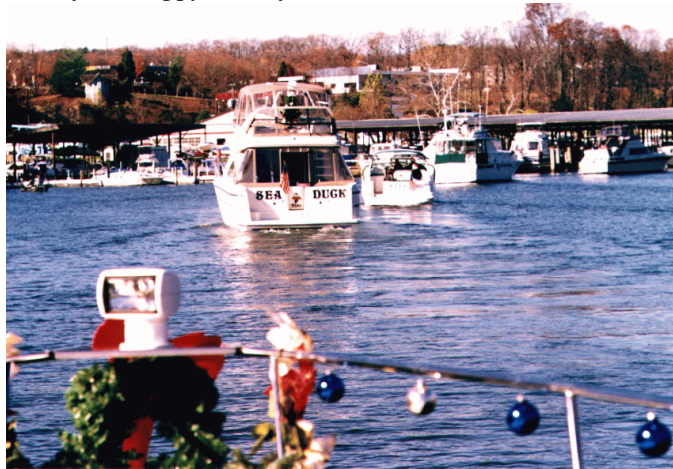
Santa cruisin'—Part of the fleet of OYCers escorting Santa to Occoquan

With the Chipmunks singing Christmas carols, OYC members fired up their engines and escorted Santa to town. As we headed up the Occoquan River in perfect OYC parade formation, we could hear the sound of hundreds of children yelling for Santa. What a great feeling it was aboard Lovin' Life! to be part of the Christmas cheer. We wish everyone a healthy and happy holiday season.