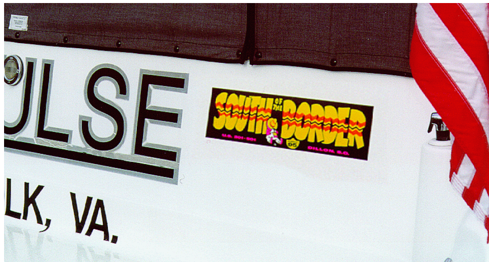
RV emulator —An (almost) unidentifiable OYC boat commemorates a favorite travel destination.

The moral here is that you should never always believe a dinner boat captain and you should always research your articles before you put them into print (our Daymarker editor says that each article published is thoroughly checked so as to eliminate any factual information). Check out the Roosevelt Island web site for more information.