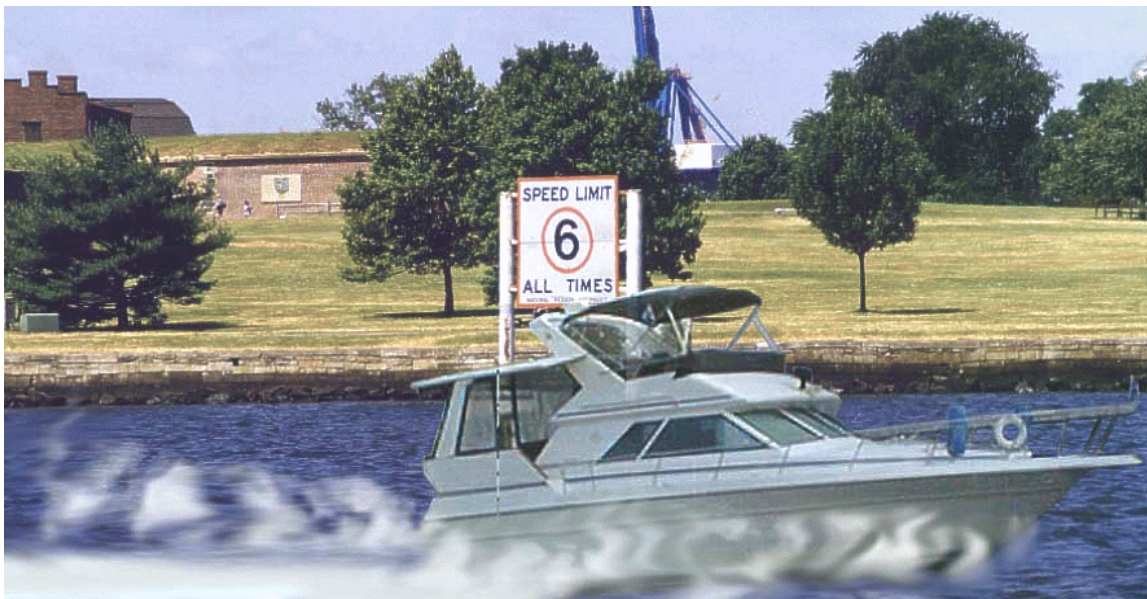
Uff Da! Makes a splash in Ballmer.